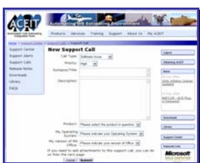
Add a New Support Call

Entering support calls online gives you the flexibility of entering a support issue no matter the time of day or night. Support calls entered online automatically go into our support center.