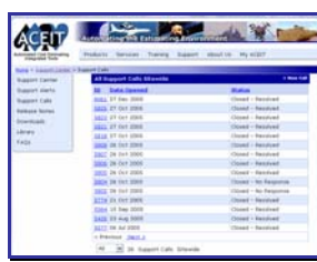
View Support Calls

Viewing support calls online allows you to view the support calls you have placed via phone or online. This also lets you see support calls placed by other employees at your location.